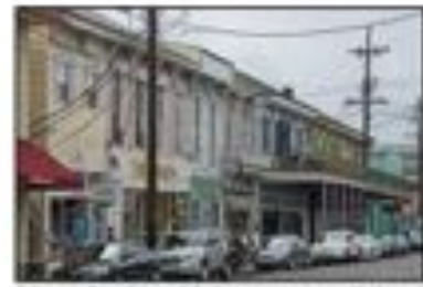
Magazine Street is home to small, local stores