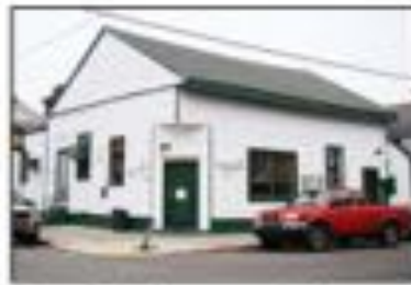
Parasol's Bar is an example of a corner commercial building