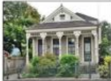
Shotgun houses show various stylistic details, featuring stock millwork of the time