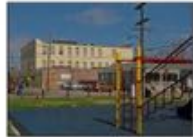
Tchoupitoulas is mix of industrial and residential types, uses in the District