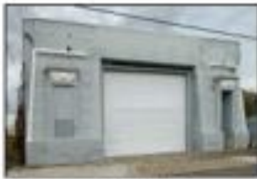
The Egyptian Revival 2219 Rousseau Street was Lafayette's courthouse