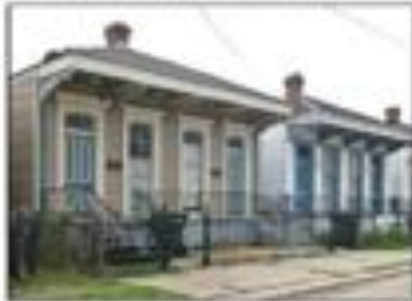
In some areas, rows of shotgun are identical